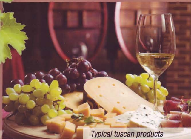
Typical tuscan products